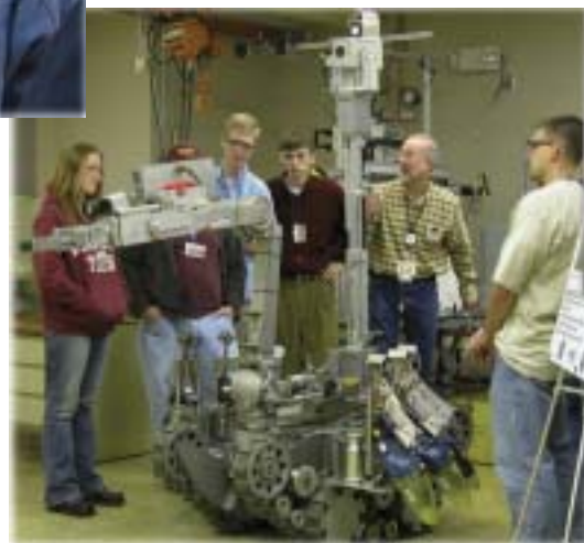
Robotics at Westinghouse

The group also toured robotics facilities where they met the Westinghouse team that placed among the top competitors in the 2003 Battle Bots competitions; the environmental impacts study facility where scientists evaluate the effects of large-scale nuclear materials production facilities on the immediate ecosystems; the weather center that constantly monitors local and state conditions and