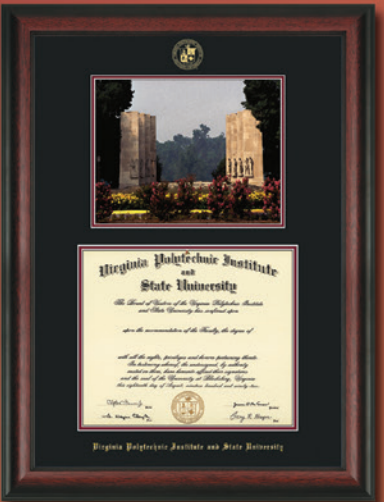
War Memorial Watercolor