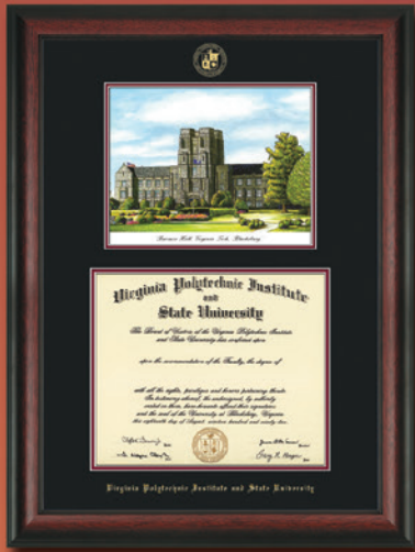
Burruss Hall Watercolor