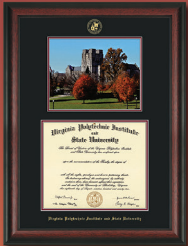
Fall at Burruss Hall Watercolor